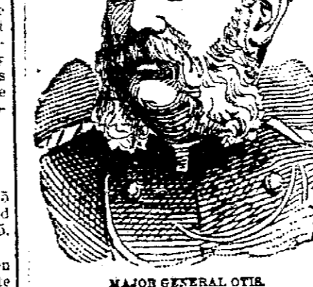
MAJOR GENERAL OTIS. At Angel island and was escorted to the Occidental hotel. General Shafter and his staff met General Otis and he was accorded full military honors.