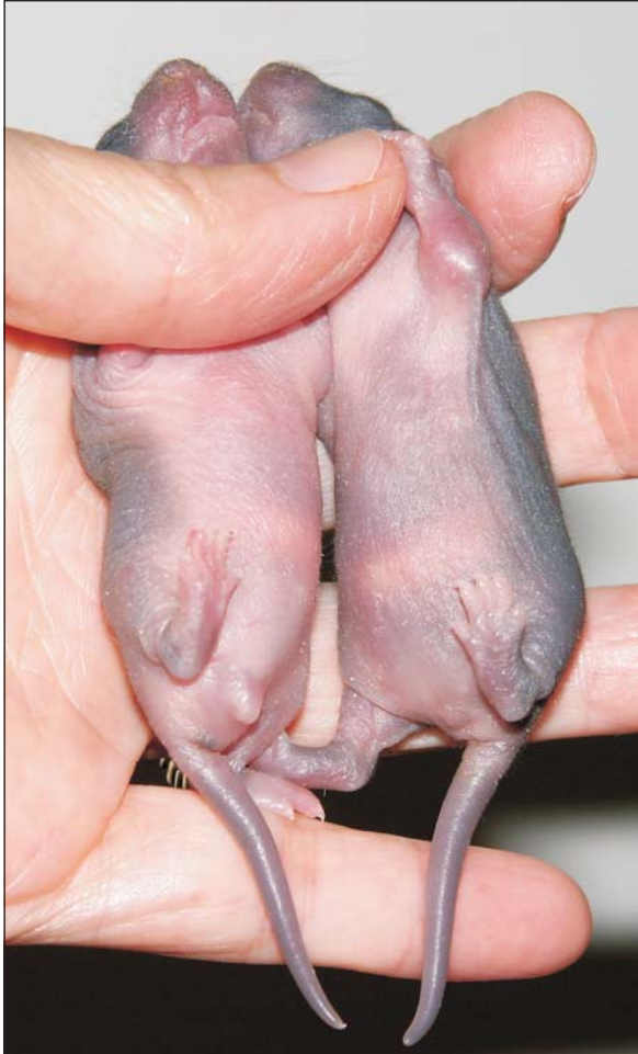
A comparison of Agouti (Rex male)(L) vs. Black (lg. El sister)(R) 5-day-old rats. Agoutis have pink bellies (look like a Tan mouse with very definite demarcation line between top color and belly) where Blacks have pigment and you can see white markings; it's not until Agoutis get fur that you can see white markings on the belly. Rats owned and bred by Karen Robbins.

The following photos shows one of baby rats comparing the difference in belly color between Agouti and Black, and three photos showing the bellies of adult Self vs. Agouti colors.