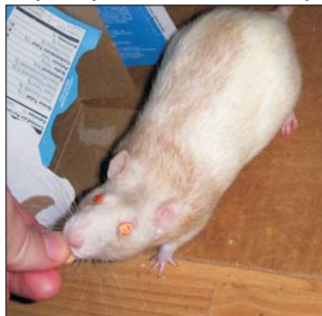
Taken with flash.