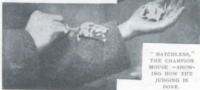
"MATCHLESS," THE CHAMPION MOUSE—SHOWING HOW THE JUDGING IS DONE.