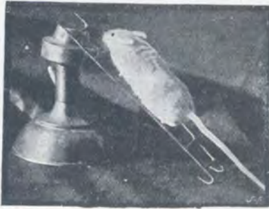
THIS MOUSE IS INVESTIGATING OUR PHOTOGRAPHER'S FLASH-LIGHT APPARATUS.

A first famous col-likely to oc-siderable those who familiar white and variety and mon little ed member