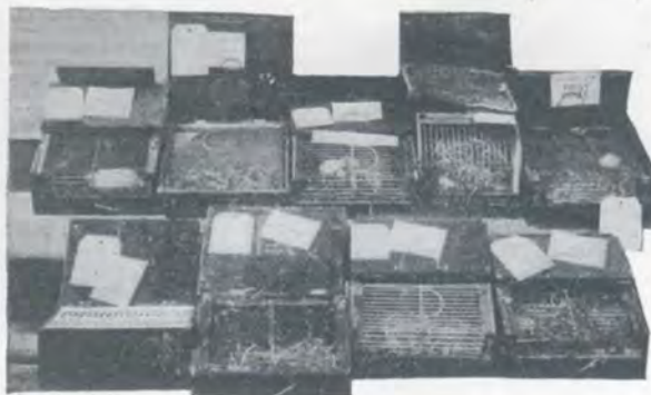
SOME OF THE MICE CAGES AT THE NATIONAL SHOW.

It is a capital hobby, full of interest and fascination.